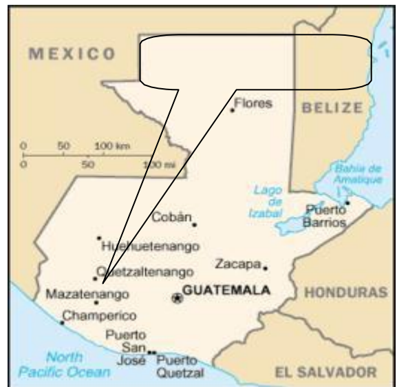
Location of Turubalá in Zunil, Quetzaltenango

The project will be undertake a full sociological, biological and environmental investigation and and been declared sound and feasible without any major remarks prior to any construction.