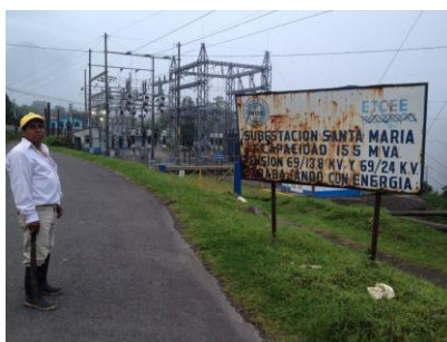
66 kV sub-station nearby