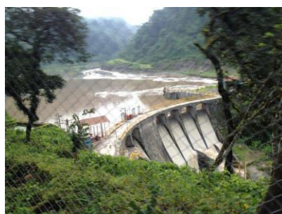
Santa Maria intake just below